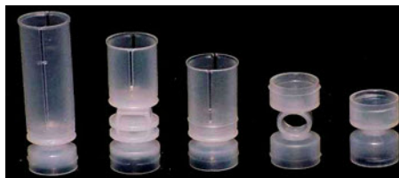
H-40 H-33 H-27 H-21 H-17

Three types of .410 plastic wads are currently available and one wax coated cork. The Gualandi Micro H17 holding 19 grams of lead shot in a 76 mm PT case. Two Mini-Container H27 holds 14gr in a 65 mm case and H33 14gr in 76mm, and the H40 with full length petals 16 gram in the 76 mm PT cases. Full length petals are to help reduce leading of the barrel walls. H40's are not recommended for guns fitted with a silencer. The wax coated cork wad is 15 mm in height and capped both ends. It can be placed directly on the powder, but can also be used with an over-powder card if required.