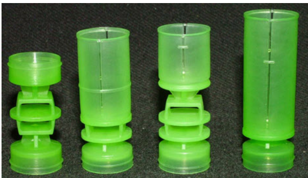
H30 H37 H38 H41

For the 28 gauge reloader we now have three types of plastic wad for the 70 mm case and one fibre type. G-H38A will hold 17/18 grams of Lead shot, H37B. 22/24gr, H41. 27/28gr. All are green in colour with a secondary gas sealing ring around the base of the shot cup to help prevent leakage just in case the powder cup was damaged in loading.