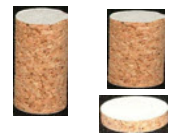
12 & 15mm Cork Wad & 4mm Cork filler

WAD4102 .410 H-21 Nana £11.00/500 WAD4103 .410 H-27 Mini-Container £11.50/500 WAD4104 .410 H-33 Mini-Container £11.00/500 WAD4107 .410 H-17 Micro £10.50/500 WAD4101 .410 H-40 £13.00/500 p&p all £4.25 per bag WAD4105 .410 12mm Waxed Cark Wad £11.00/500 WAD4106 .410 15mm Waxed Cork Wad £12.50/500 CORK4101 .410 4mm Capped Cork filler £10.00/500