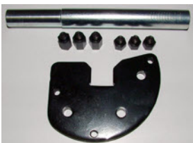
9165 Euro kit for 2¾" & 3"