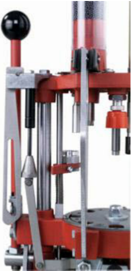
Gas Assist system

Primer Feed Shut Off Can shut off the primer feed tube instead of removing it. Can be retrofitted to most 366 Auto reloaders. £33.00 dc. £3.50